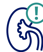
Progressive kidney damage or ESKD